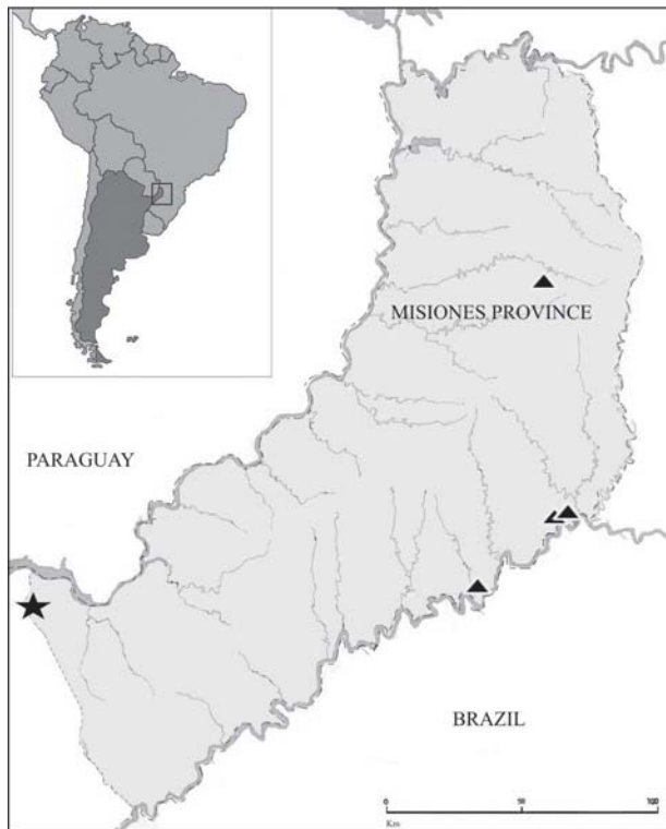
Fig. 1. Report site (indicated by star) of the yellow belly frog infected by Bd in Misiones province, northeastern Argentina. The triangles represent four Lithobates catesbeianus (American bullfrog) localities (Pereyra et al., 2006).

phibians in Argentina and Paraguay, but also is one of the richest batrachological areas in Brazil (Brusquetti & Lavilla, 2006; Cochran, 1955; Cei, 1980). The Atlantic forest is also characterized by its high level of endemic species (Placi & Di Bitetti, 2005). While only about 3% and 10% of the original cover exist in Brazil and Paraguay, respectively, Argentina still maintains 50% of the original forest (Holz & Placci, 2005; Giraud et al., 2005). Previously, Bd was reported from several localities from Jaqueira (Pernambuco, Brazil; Carnaval et al., 2005, 2006; Toledo et al., 2006) at a straight-line distance of about 2900 km to Misiones.